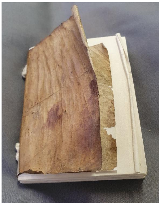
1The Gresley Dance Book about the size of a double CD