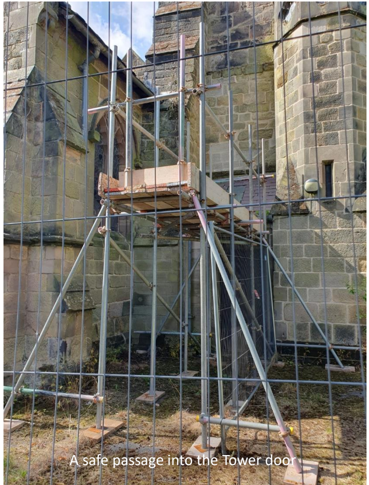
A safe passage into the Tower door